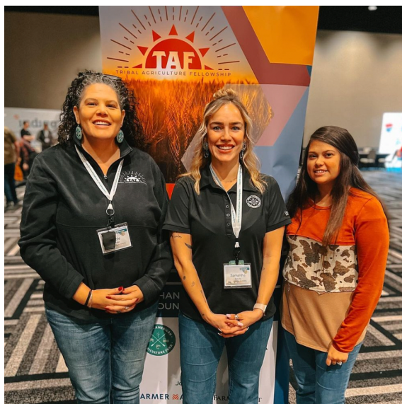
TAF Staff attending the 35th Annual IAC Conference.