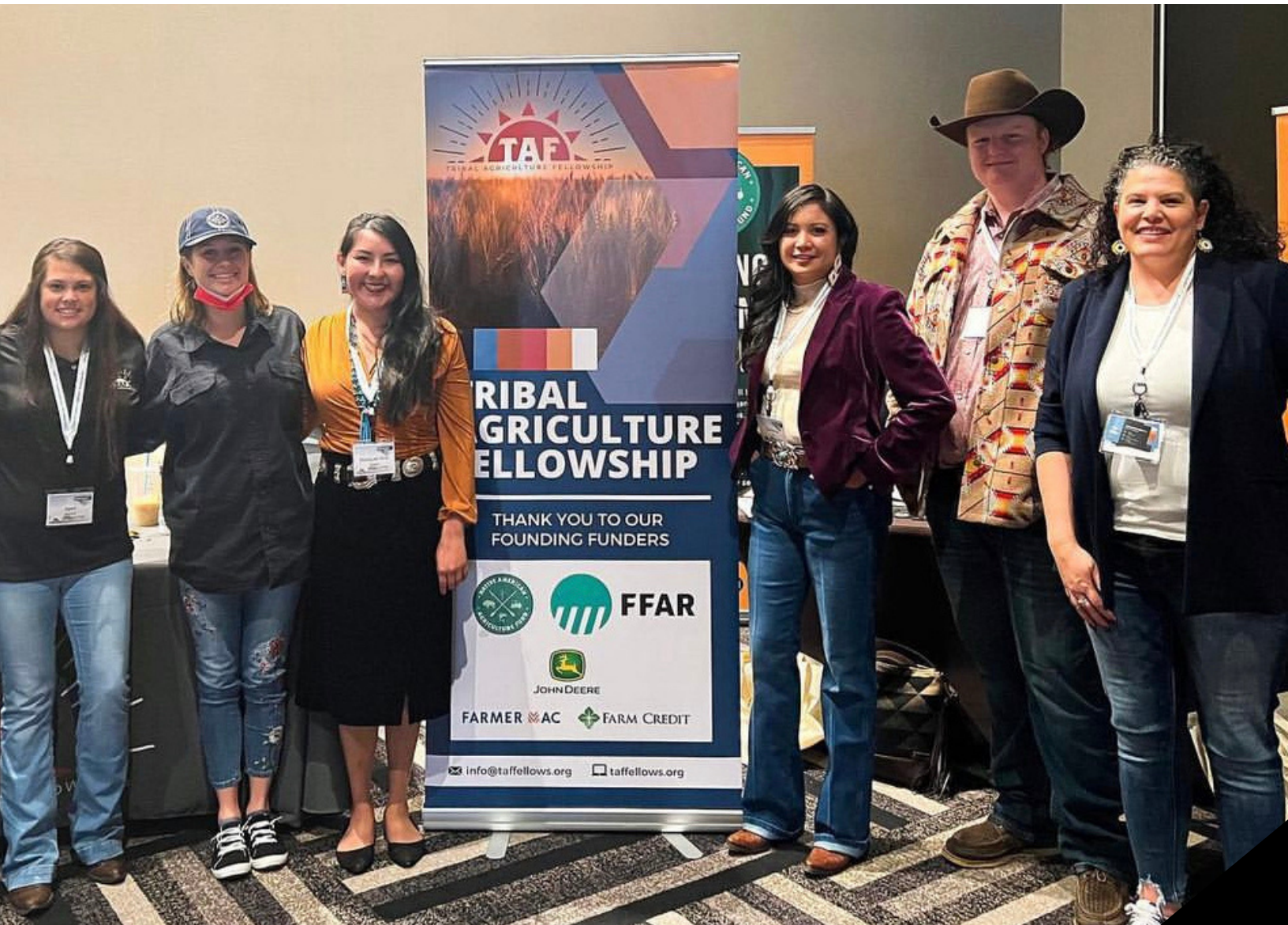
TAF Staff and several TAFellows were able to attend the 35th Annual IAC Conference.

Since time immemorial Indigenous peoples have been stewards of this land. By making a gift, you ensure that stewardship continues to be prevalent for future generations to come. Your generosity provides financial support and shows the next generation of Native agriculturists that their work is valued and can positively impact regionally, nationally, and globally.